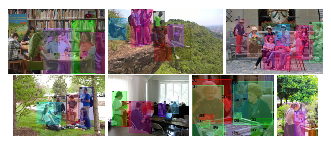
Figure 3. Representative images from the BodyHands dataset. Hands and bodies belonging to the same person have bounding boxes in the same color and identification numbers.

Annotation and Quality Control. We hired several annotation workers to annotate our dataset. For each person with