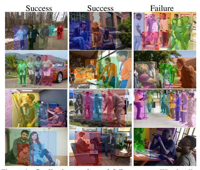
Figure 4. Qualitative results and failure cases. We visualize hands and bodies that belong to the same person using the same color and identification numbers.

MaskRCNN + X. We train MaskRCNN using a ResNet101 backbone to detect hands and bodies. We then use the Hungarian matching algorithm to match hands to bodies us-