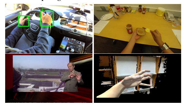
Figure 4. Existing hand datasets are very different from ours. This shows some representative images from: VIVA [36] (top left), EpicKitchen [7] (top right), BSL [31] (bottom left) and Synth-Hands [23] (bottom right).

ery fifteenth frame. We annotated only those hand instances whose visible areas' axis-parallel bounding box had more than 100 pixels and whose trajectory appear for more than 50 frames. Our dataset was annotated by three annotators and subsequently verified by two people.