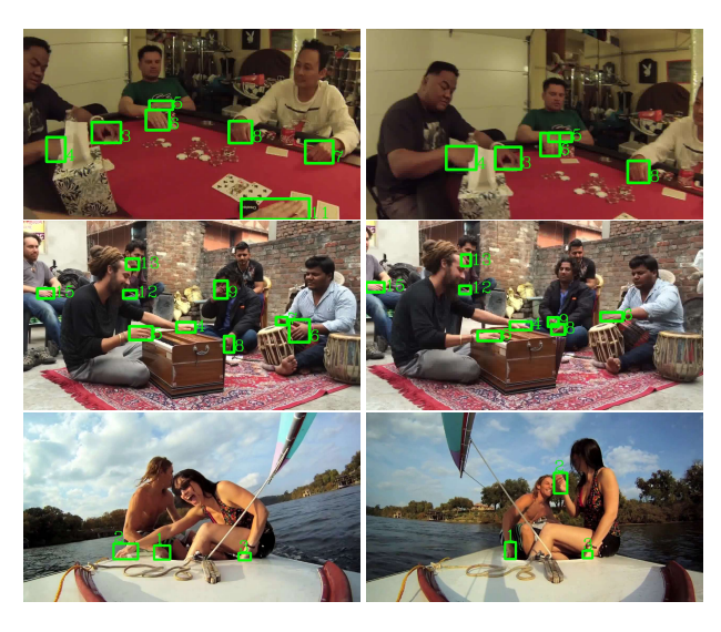
Figure 2. Representative image sequences from our dataset. The size, shape, location, appearance, and visibility of a hand can change drastically and frequently.

Backward Regression that uses outputs from the Forward Propagation to obtain the hand locations for frame t as well as their counterparts in frame t-1, and estimate their confidence conditioned on both the objectness scores at frames t and t-1 as shown in Fig. 1. This allows us to link hand detections between two frames. Third, we establish correspondence between hand tracklets via pose association. This is to leverage the fact that hands are undetachable parts of a human body, so we can use pose to recover prematurely terminated hand tracklets.