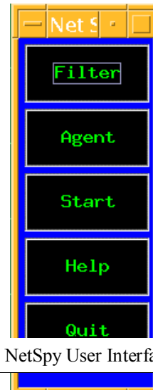
Figure 1. Main NetSpy User Interface

An Agent is the union of an Operation and a Filter. NetSpy supports multiple Agents simultaneously and allows users to activate and deactivate them as needed. To manage the Agents that are currently present, NetSpy employs the services of the AgentMap class, which maintains a list of all Agents and Filters currently defined in the system. Each Filter and each Operation can be part of zero or more Agents, whereas each Agent should contain exactly one Filter and one Operation. The AgentMap provides methods