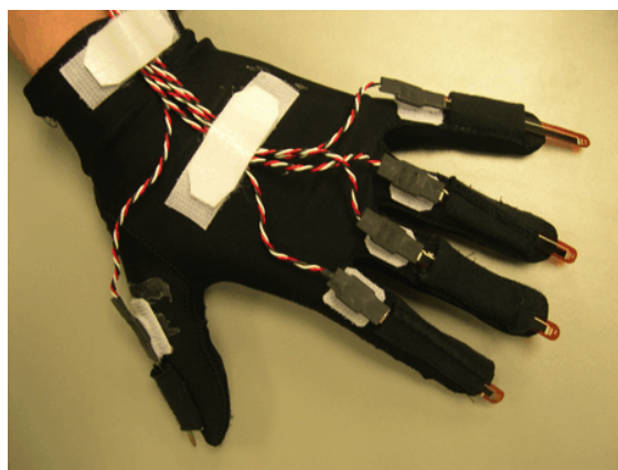
Figure 2. Glove with sensors