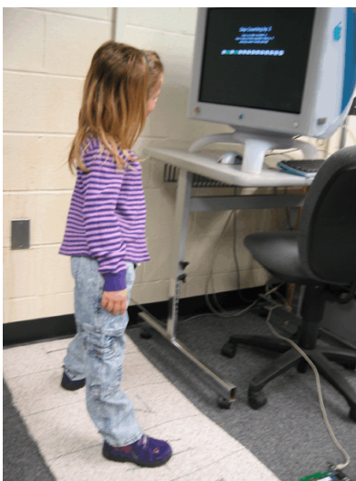
Figure 1. Floor mat as number line

We incorporate computer vision into Director applications using the TrackThemColors xtra. This xtra provides functions that process images from an ordinary webcam (using USB) or a digital video camera (using Firewire). These functions support finding spots of a given color, finding the brightest spot, tracking points of a given color, and detecting motion in an image region. A tolerance is given in most cases, allowing for