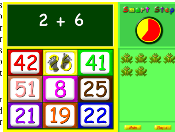
Figure 4. Math with Smart Step

Figure 4 shows a screen shot from an application that helps students to practice their arithmetic skills. As math problems flash onto the screen, the children jump onto colorful squares on the floor (equipped with touch sensors) to answer the questions. A separate interface allows the teacher to customize the problems so that they are appropriate for the student using the application.