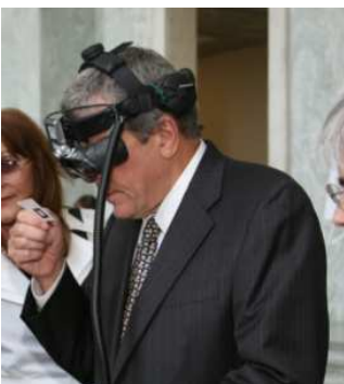
Fig. 1. Left: A computer vision system for identifying temperate plants on the botanically well-studied Plummers Island, Maryland, USA. Right: Congressman John Tanner tries an augmented reality version of the system.

complete third dataset that covers all the trees of Central Park in NYC. The system is currently being used by botanists at the Smithsonian to help catalogue and monitor plant species. Figure 1 shows the system and various versions of the user interface (UI). Although a great deal of work remains to be done in this ongoing collaboration between computer vision researchers and scientists at the US National Herbarium, we hope that our system will serve as a model and possible stepping stone for future mobile systems that use computer vision-based recognition modules as one of their key components.