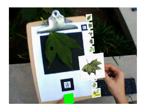
Fig. 5. AR user interface viewed through a video see-through display.

is necessary when matching is imperfect. Selecting a match button associates a given species with the newly collected specimen in the collection database. The history pane displays a visual history of each collected leaf, along with access to previous search results, also in a ZUI. This represents the collection trip, which can be exported for botanical research, and provides a reference for previously collected specimens. Making this data available improves the long term use of the system by aiding botanists in their research.